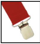
Jumbo Clip for Suspenders